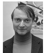
ROY LICHTENSTEIN (1923-1997)

Common place, mass-produced objects used as subject matter combined with bright, bold colours, rejecting the supremacy of "high art". Images of popular culture such as advertising and comic books, are often seen.