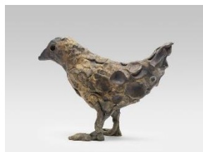
The Horizon, UGO RONDINONE (2011)