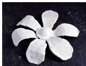
Flowers, UGO RONDINONE (1988)