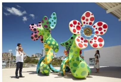
Flowers that Bloom in the Cosmos, YAYOI KUSAMA (2002)