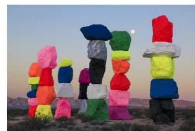
Seven Magic Mountains, UGO RONDINONE (2016)